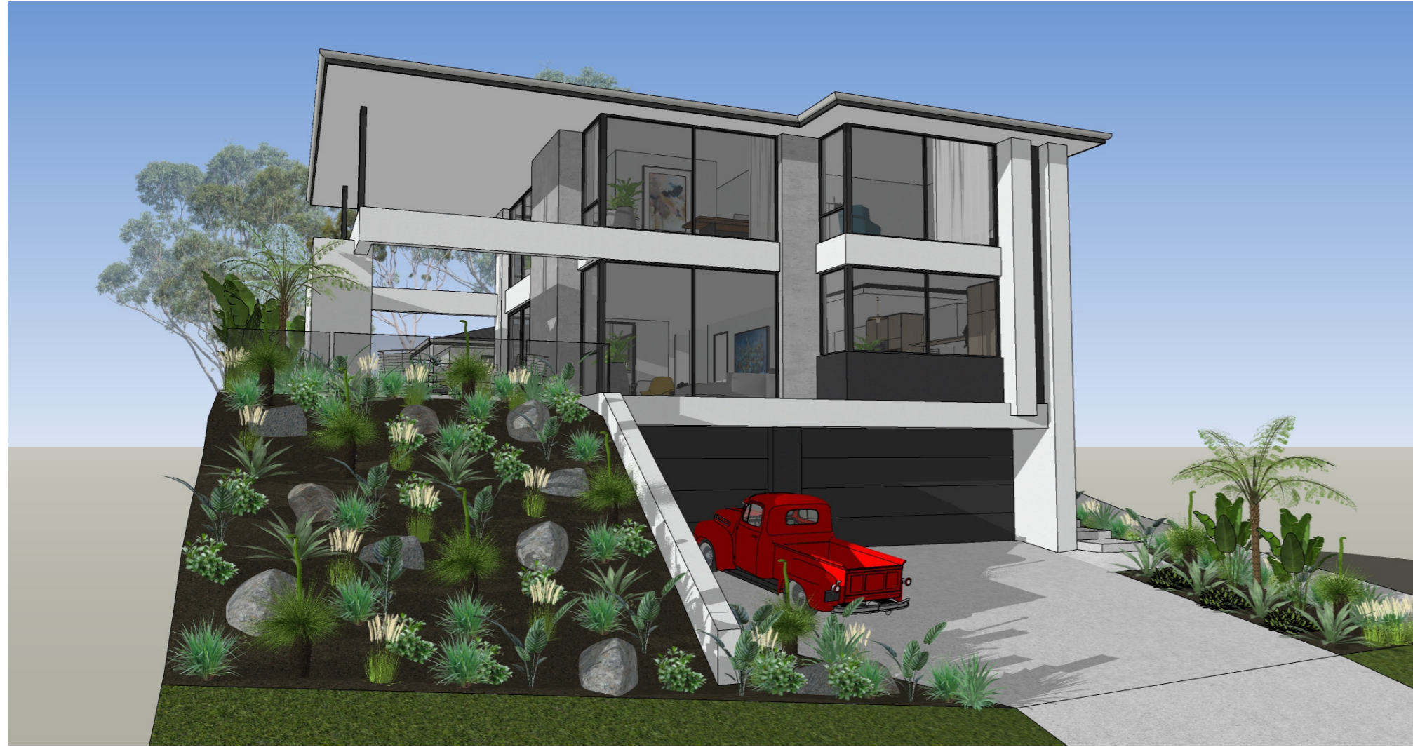
3D Perspective Not to scale