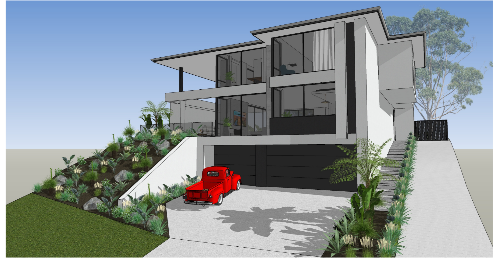
3D Perspective Not to scale