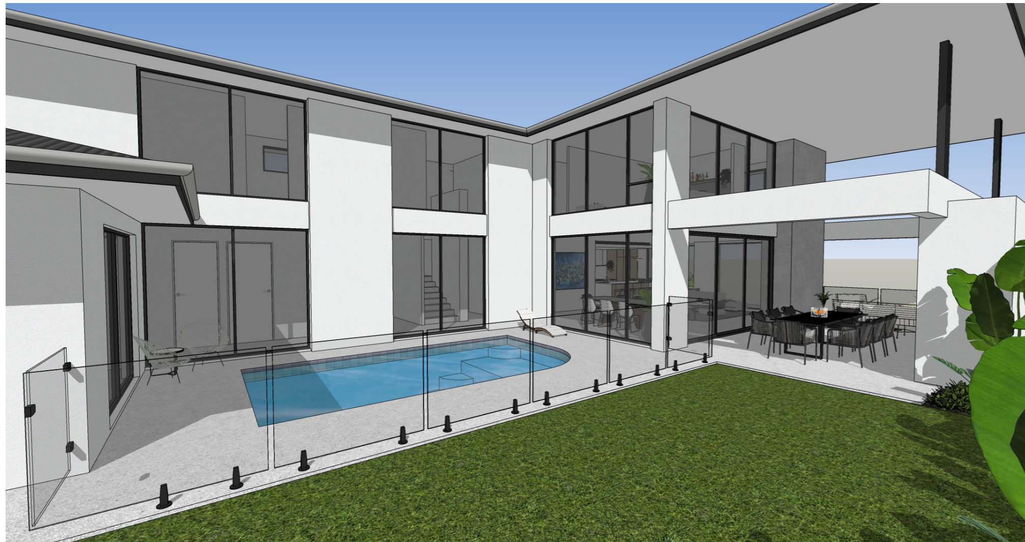
3D Perspective Not to scale