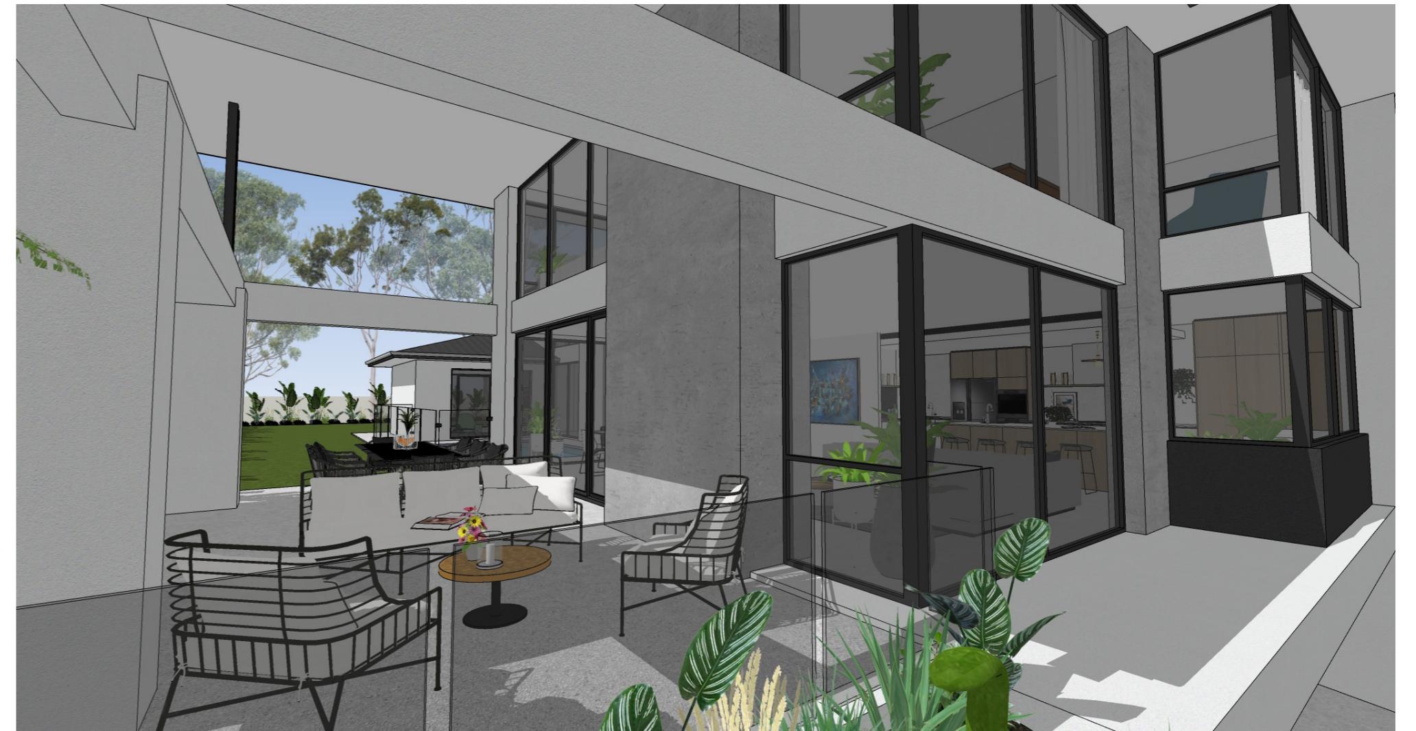
3D Perspective Not to scale