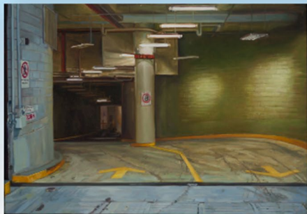
an example of Olga's work