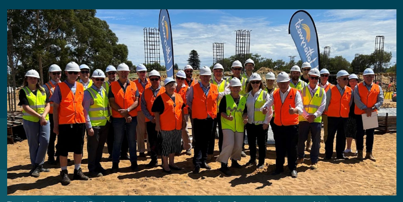
Thumbs up from the Hon. David Templeman (Sport and Recreation Minister) at the State Government's announcement of their $1.3 million Lotterywest Grant on 1 March 2023.