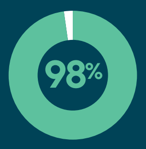
FOGO waste service provided to 98% of residential properties