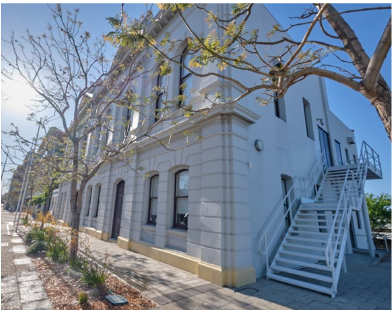
Town Hall with the Mechanics Institute including the East Fremantle Public Library and Fire Station