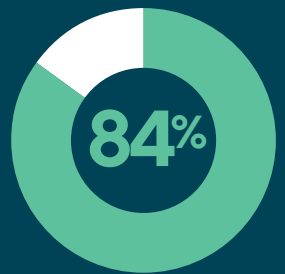
84% recovery on recycling (yellow top recycling bin)