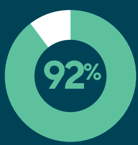
92% recovery on FOGO bin