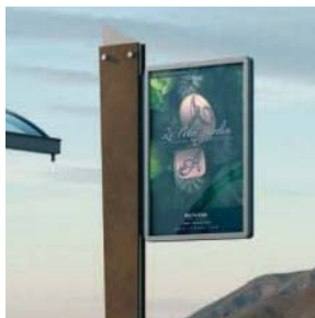
↻ Metalco Omniexpo Sign