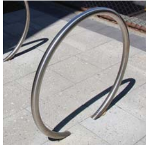
Cora 316 Stainless Steel Cycle Rack with sub-surface mounting (model CBR4f) ↻