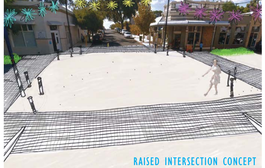
RAISED INTERSECTION CONCEPT