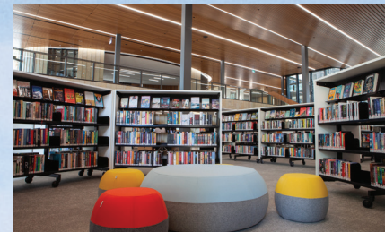
Library Services $138k (Fremantle Library)