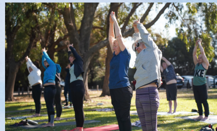
Community Events $174k