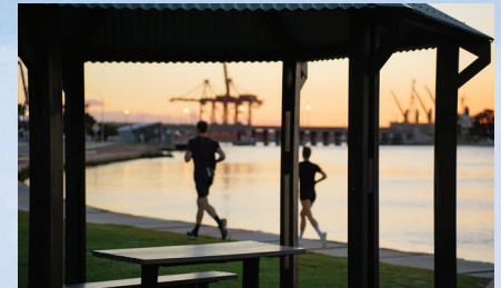
Parks and Ovals $310k

Building upgrades $1.63m (including completion of Fremantle Women's change room upgrade and new building project)