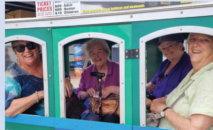
Neighbourhood Link $692k (Federal funding)