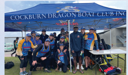
Community Sponsorship $114k