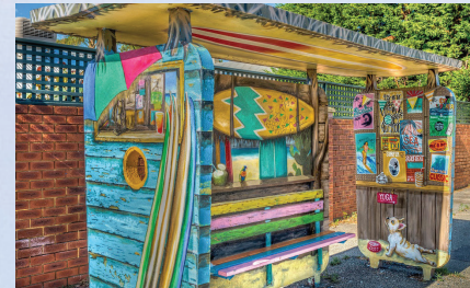
Public Art $45k