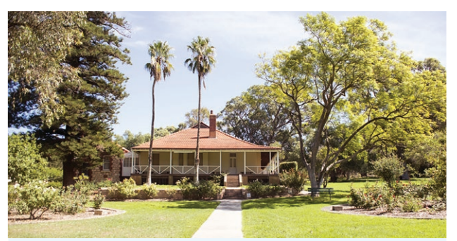
Azelia Ley Homestead Museum