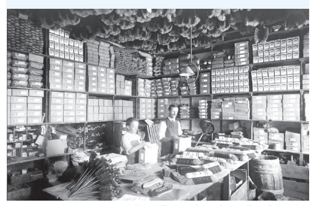
Brush Factory, Duke Street East Fremantle

The morning tea will be held at 10am on Thursday, 13 July at the Glyde-In Community Learning Centre. To register, head to 'Events' on our website.